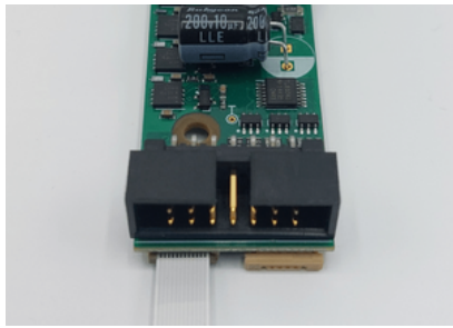
Controller - XLA-1 & XLA-5