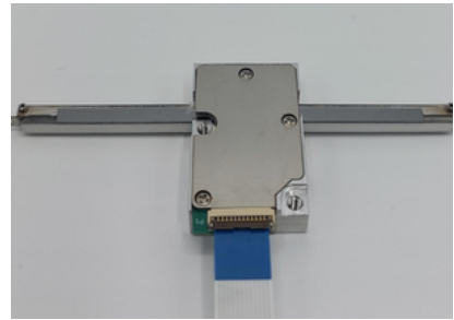
Actuator - XLA-1