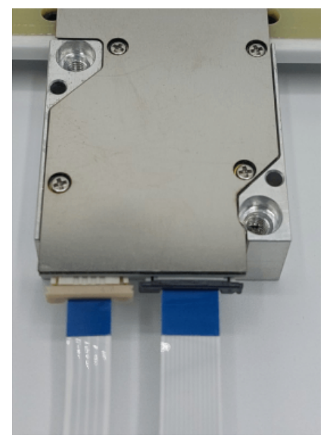
Actuator - XLA-10